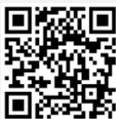
User Manual e-Request