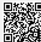
Video of using Inventech Connect

* Note Operation of the electronic conferencing system and Inventech Connect systems. Check internet of shareholder or proxy include equipment and/or program that can use for best performance. Please use equipment and/or program as the follows to use systems.