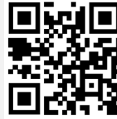
Video for User

* Note Operation of the electronic conferencing system and Inventech Connect systems. Check internet of shareholder or proxy include equipment and/or program that can use for best performance. Please use equipment and/or program as the follows to use systems.